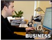
Business Travelers Who Blog