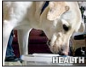
Finding Cancer by Smell