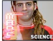
Dorks and Their Art