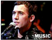
Pop Review: Sufjan Stevens